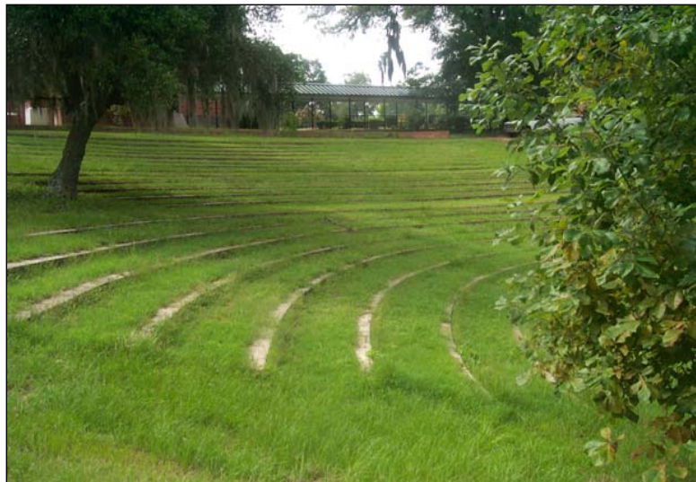
St. John's School Amphitheater constructed by the Works Progress Administration in the 1930's.

Other components of this project include the establishment of a nature trail with tree identification signage, planting an arboretum, construction of a pavilion, development of a website for the nature center, development of a nature center curriculum, an Arbor Day celebration, and publishing an informational brochure.