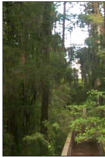
Existing Observation Deck