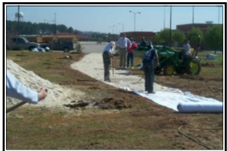
Developing the trail, Faculty, Students and Volunteers, doing what it takes to get the job completed.

Everyone is encouraged to visit the project website where numerous photos of the progress to date are available. http://pdrcd.tripod.com/MCHproject.html